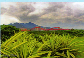
Guandu Bridge 關渡大橋

There will be a first aid station at the start/finish.