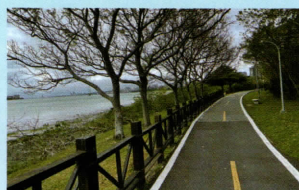
Tamsui Golden Riverside 淡水金色河岸