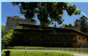
Beitou Park Library 北投公園圖書館